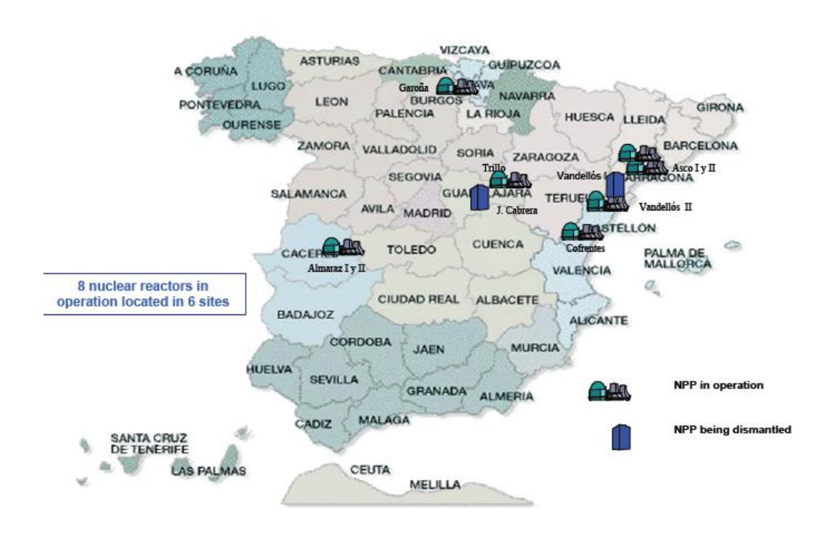
FIG.2 Location of Spanish NPPs

* UCF (Unit Capability Factor) (only applicable to reactors in operation).